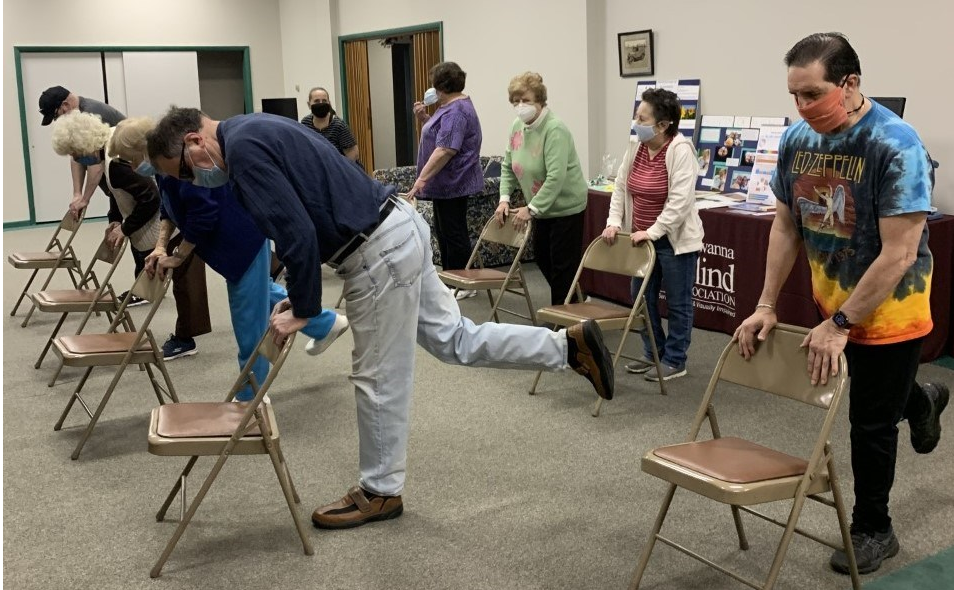
Left, LBA clients in the Exercise/Stress Management Program which is held every Monday during the year.

226 individuals received 1,316 hours of Life Enrichment Instruction in their homes or in a community setting to maintain or improve their activities of daily living