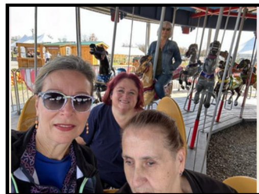
Lakeland Orchard outing

Seasonal parties and outings: summer picnic, fall outing, Winter Wonderland party. Our monthly calendar of events is available in email, audio, print and braille formats to keep our clients abreast of the latest agency happenings.