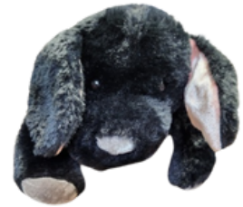
Beacon's Magic World of Vision Third Grade Educational Program