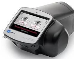
Spot Vision Screener